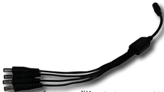
4-way splitter (only comes with CM6004PC)