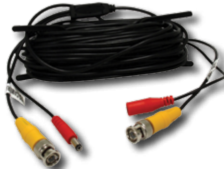
BNC Video & DC Power Cable