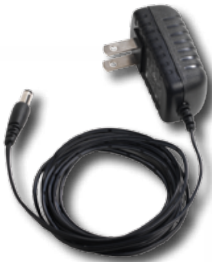
12V DC Power Adaptor